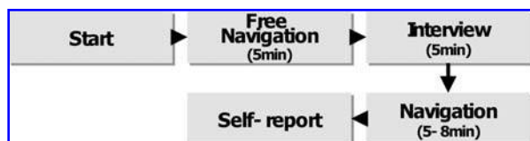
FIG. 2. The experimental procedure for one session.

tion were given as a rating on an 11-point scale, ranging from “not at all” to “extremely.” The participants then practiced with a VE exercise until they became familiar with the interfaces and navigation in the virtual public bar. The CET virtual bar program consisted of six sessions, each session including different questions and procedures (Table 2). The experimental procedure is presented in Figure 2.