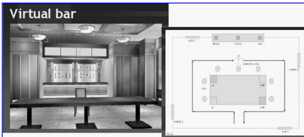
FIG. 1. Representative stimuli in the three-dimensional (virtual bar) condition.

from the fact that VEs can present a context-specific stimulus with a high degree of ecological validity. However, our pilot study has been the study that confirmed the power of VE to reduce nicotine craving. In the present paper, we applied the VE-CET repeatedly to nicotine addicts, to confirm whether this method reduces the degree of craving for the drug over the course of the treatment sessions.